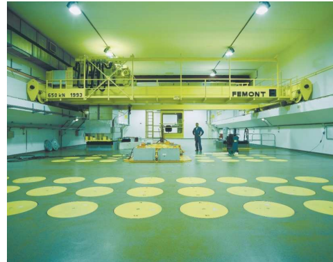
Stress test assessment of waste interim storage facilities at Belgoprocess (Dessel BE)