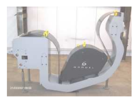
Divertor cassette mock-up