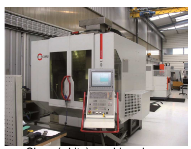
Clean (white) machine shop